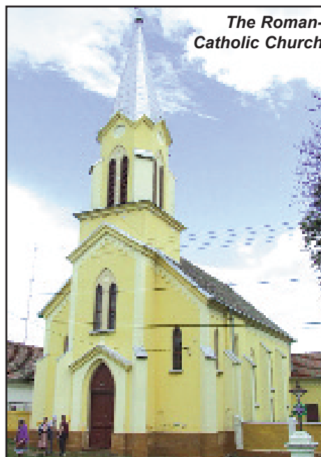
The Roman-Catholic Church

The image presents the graduation picture - class of 1960 - of the seven-year elementary school from Fibiș.