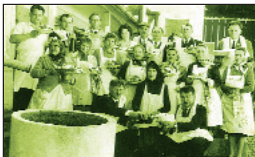
Pastry contest - Fibiș, 1967

Remnants have been discovered on the territory of present-day Fibiș ever since ancient times. Such remnants are the copper axe from the Bronze Age, the Roman wall with traces found in different points of the settlement, like Maghiarod Pusta, Valea Borduș or Răchiți. The most recent one was found at approximately 50-100 metres NW of the locality. The ruins of a monastery can be found near the neighbouring locality of Seceani ("The Monastery next to the Black Water"), presumed to be an orthodox monastery founded in the XVI th -XVII th centuries.